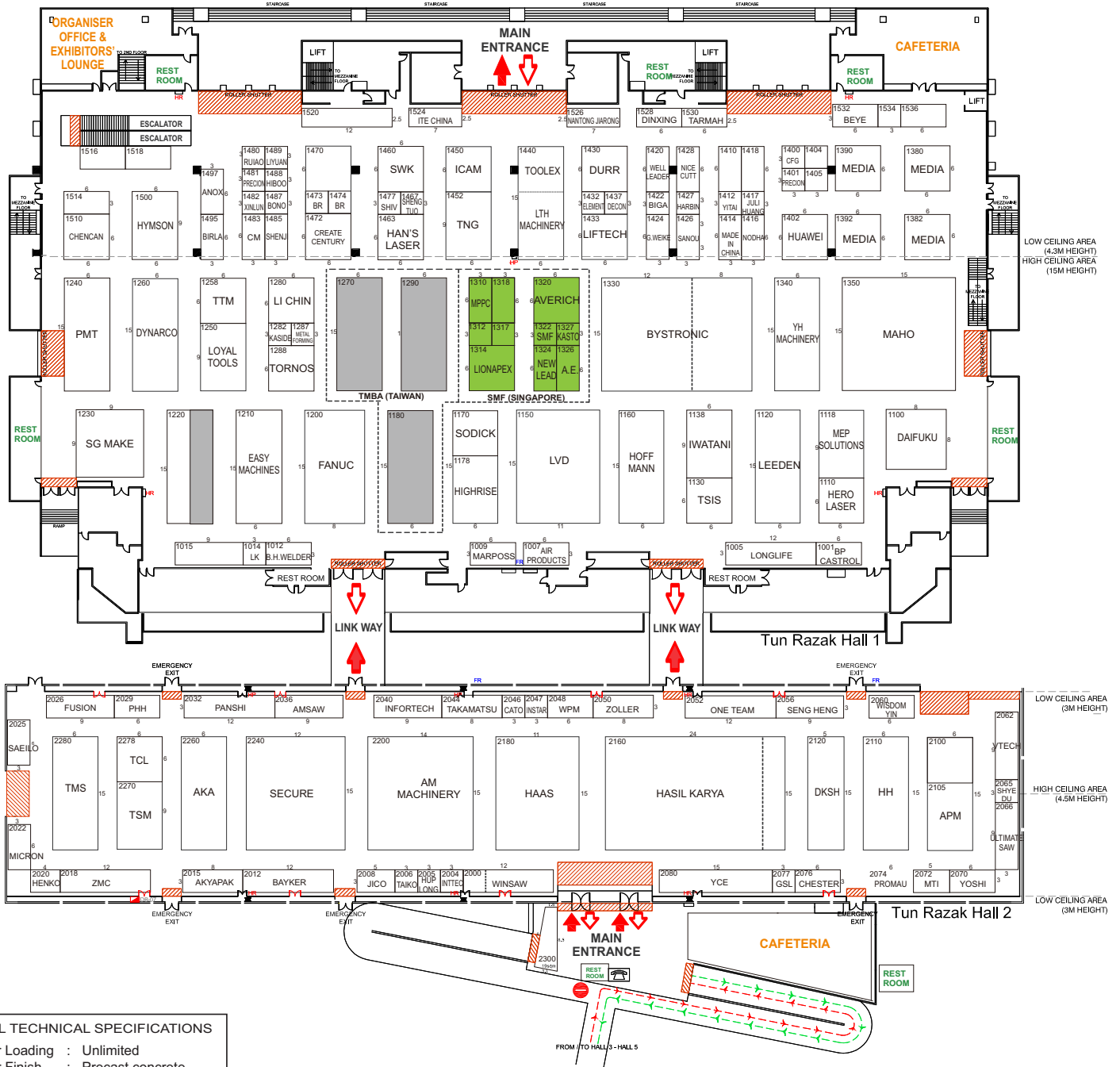
EXHIBIT PROFILES: MACHINE TOOLS TECHNOLOGY SHEET METAL TECHNOLOGY WELDING TECHNOLOGY

HALL TECHNICAL SPECIFICATIONS Floor Loading : Unlimited Floor Finish : Precast concrete Ceiling Height : Hall 1 Mezzanine Floor : Max 2.8m Hall 2 Perimeter Stand : Max 2.8m